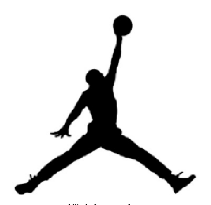
Nike's Jumpman logo