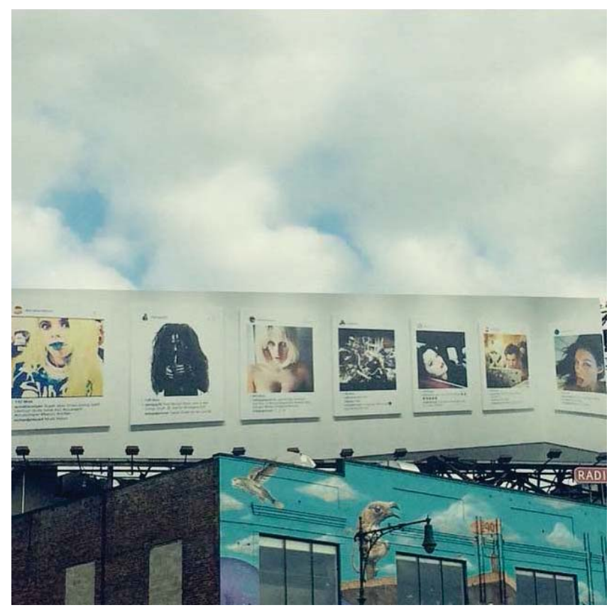
The Billboard (Fig. 3)

whether it was erected before the New Portraits exhibition closed in October 2014.