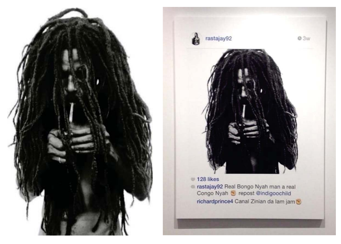
Graham's Rastafarian Smoking a Joint (Fig. 1)

rastajay92's Instagram post, which now included his own comment,<sup>5</sup> as well as the other elements of the Instagram graphic interface: rastajay92's username and comment, the number of "likes" rastajay92's post had received – 128 in this instance – and the number of weeks that elapsed between rastajay92's post and Prince's screenshot – three weeks here. ( Id. ¶ 34.) Prince then printed – or arranged for someone else to print – the screenshot onto canvas in order to create the final artwork at issue in this litigation: Untitled. ( Id. ¶ 34, Ex. B; see Fig. 2.)