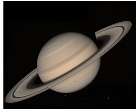
(left: Getty Images photograph/right: original NASA photograph) 2